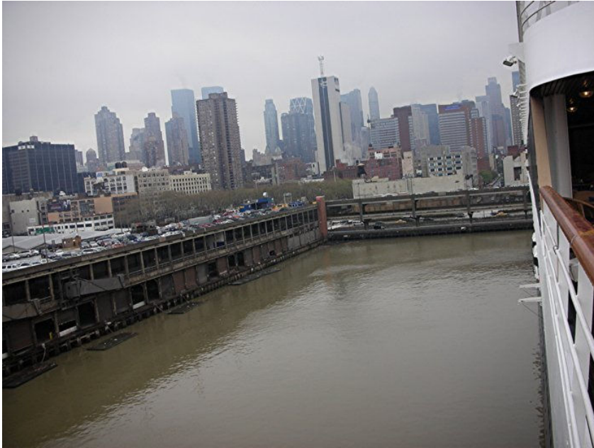
Port side of the Amsterdam looking toward the next pier and Manhattan.

There were about 300 people who were leaving the Amsterdam in New York City and they had first priority in clearing US Customs and Immigration procedures so they could get on their way. About 10:30am we were able to get off the ship and walk in to Times Square in New York City. It wasn't raining and it