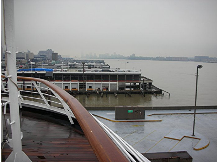
Looking down the Hudson River.